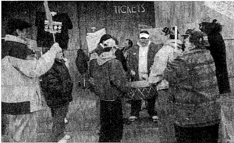
Chicago Indians protest The Chief.

pose of this university. The University of Illinois has a responsibility to educate its students, an endeavor that at least minimally involves the transmission of factual and accurate information which constitutes the wide variety in kinds of knowledge. Furthermore, because the university is a public institution which receives both state and federal funds, it also has a responsibility to provide equal opportunity for all of its students and potential students, regardless of race and creed. This assumption is consistent with proclamations by the university President which state that "increased opportunities for women and minorities lies in a renewed commitment, an improved campus climate, and the full utilization of the diverse talents of all members of the university community." Finally, I assume that the President's commitment to "increased opportunities" and "an improved campus climate" is necessary because many "women and minorities" have been historically excluded, overlooked, ignored or made unwelcome at this campus—I can think of no other framework in which to interpret the President's remarks.